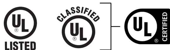
UL Listing Marks